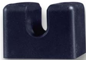
Shown without a mounting base

Both BDF and BDP sensors are available with or without mounting base. The mounting recommendations for both configurations are as follows.