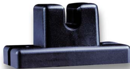
Shown with a mounting base