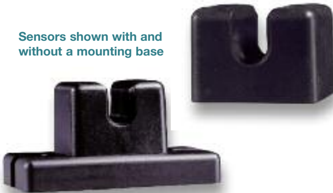
Sensors shown with and without a mounting base

Introtek's BDF (for soft tubing) and BDP (for rigid tubing) sensors are available with or without a mounting base. The BDF sensor is constructed of either rigid epoxy or ABS plastic and the BDP sensor is constructed of soft polyurethane.